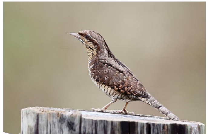
Figure-1. Shows Eurasian Wryneck Jynx torquilla sighted in Belagavi, North Karnataka

records of the said bird in southern India. Whereas, distribution map given by Rasmussen & Anderton (2012) and Arlott (2014) not showing its range in Southern India. Therefore present sighting record of Eurasian Wryneck in southern India is worth of its documentation. Since, there is no published literature of Eurasian Wryneck sighting from Belagavi. It becomes the first photographic sighting record from Belagavi.