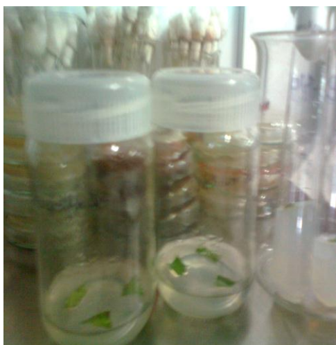
Figure-2. Explants in triplicates on MS media with growth hormones for callus induction

2, 4-Dichlorophenoxyacetic acid (2, 4-D) with different concentration (0.5-10mg/l) showed stimulatory effects on callus induction (Table-2 and Fig-3). Maximum callusing response (75% in stem and 79% in leaf) was noted at 2.5mg/l.