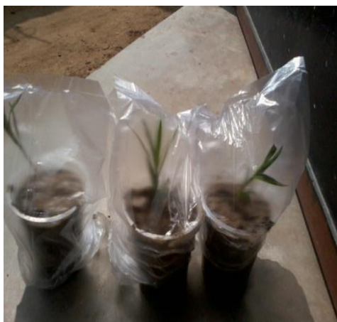
Figure-6. Hardening- Plants covered with plastic.