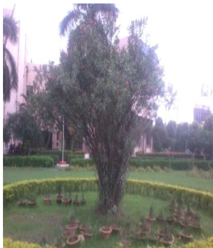
Figure-1. Whole plant of Nerium odorum