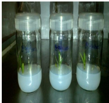
Figure-5. Root regeneration of Nerium odorum on MS fortified with BAP (1.5 mg/l) and NAA (0.5 mg/l).