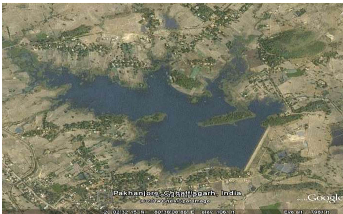
Figure-1. Satellite image of Pkhanjore Dam

Sakhare (2001) reported 23 species belonging to 7 orders where cyprinidae family was dominant with 11 species from Jawalgaon reservoir