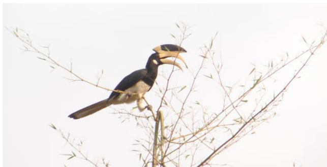
Figure-2. Showing Malabar Pied Hornbill Anthracoceros coronatus in Dense forest of Tillari