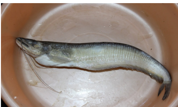
Figure-4. W. attu