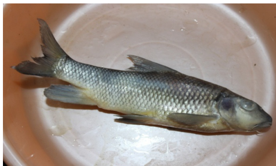
Figure-7. L. fimbriatus