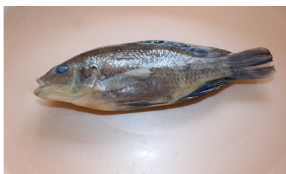
Figure-8. O. mossambicus