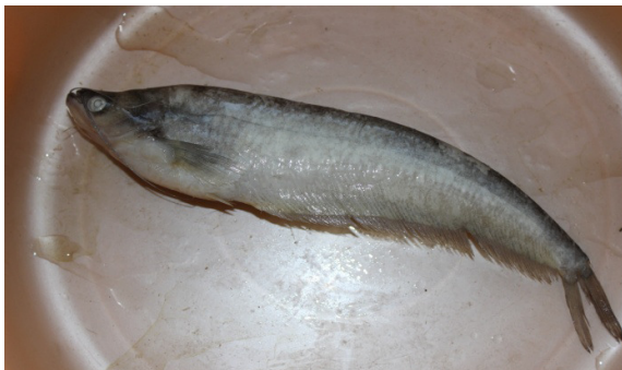
Figure-3. M. singtee